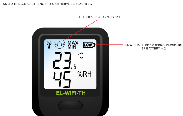
1) NORMAL DISPLAY - CURRENT TEMPERATURE