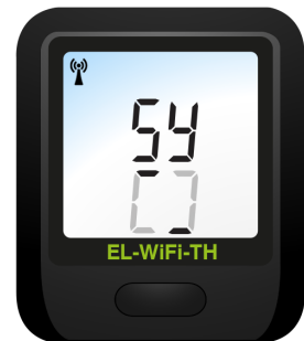
5) DATA SYNCING