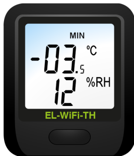
3) MINIMUM RECORDED VALUES SINCE LAST RESET