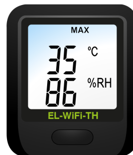
2) MAXIMUM RECORDED VALUES SINCE LAST RESET